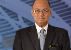
SPECIAL COMMISSIONERS OF INCOME TAX DATO' ISKANDAR ALI BIN DEWA