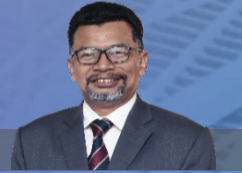
DEPUTY SECRETARY GENERAL OF TREASURY (POLICY) DATO' ZAMZURI BIN ABDUL AZIZ