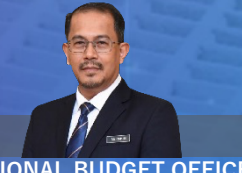
NATIONAL BUDGET OFFICE DATO' SRI AB RAHIM BIN AB RAHMAN